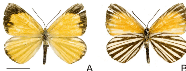
FIGURE 1. Aricoris terias collected in the municipality of Loanda, state of Paraná, Brazil; male: dorsal (A), ventral (B).

for vast areas of Southern Cone obstructs the knowledge of the continuity among sampled areas.